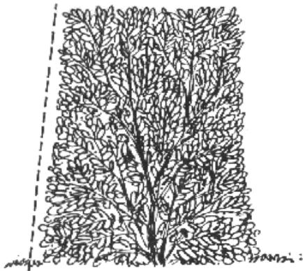
Fig. 21 Prune hedge so base is broader than top. Regular pruning is necessary throughout life of plant.