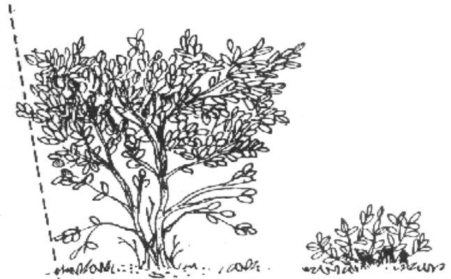
Fig. 22 If deciduous hedges lose their lower leaves and become Leggy, cut the plant to the ground (shown at right) and shape new growth as it develops, keeping base broader than the top.